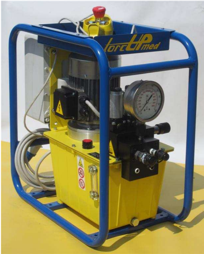
Pump without auto cycle