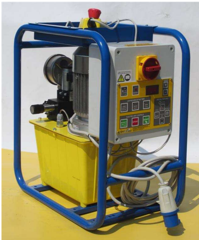
Pump with auto cycle